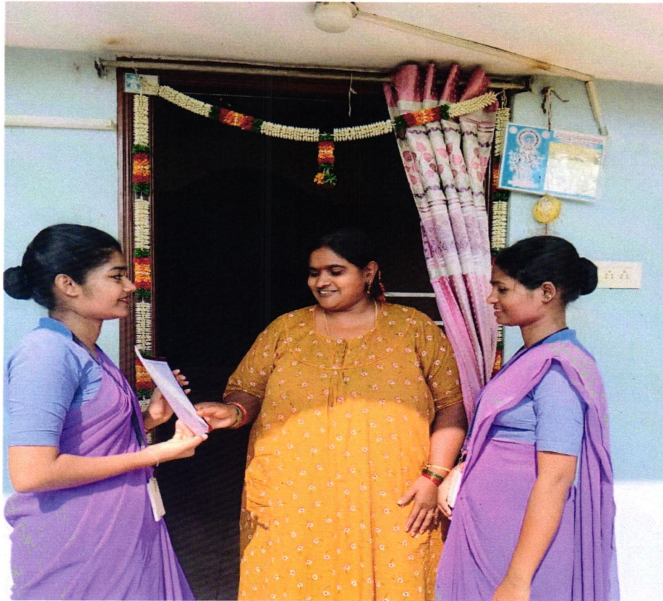
Giving Basic Health Counselling by Students

e-mail : narayana_nursing@yahoo.co.in website : www.narayanannursingcollege.com