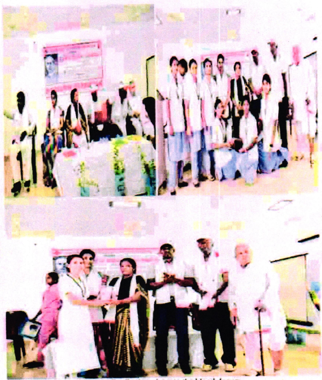
Fig: volunteers distributing dates to the blood donors

Recognized by Indian Nursing Council vide letter No. 1831/R2003 dated: 08.11.2003, Affiliated to NTR University of Health Sciences, A.P. Vijayawada e-mail : narayana_nursing@yahoo.co.in website : www.narayanannursingcollege.com