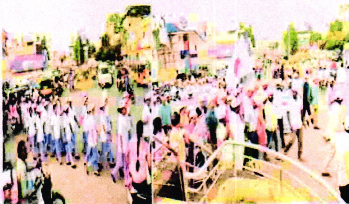
Fig: students were participated in rally

Recognized by Indian Nursing Council vide letter No. 18/918/2003 dated: 04.11.2002. Affiliated to NTH University of Health Sciences, A.P. Vijayawada e-mail : narayana_nursing@yahoo.co.in website : www.narayannursingcollege.com