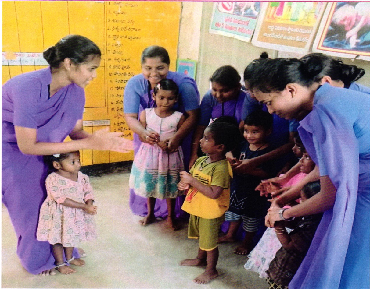
Demo and Return demo of handwashing Procedure, Kakatur, 15/10/2019

e-mail : narayana_nursing@yahoo.co.in website : www.narayanannursingcollege.com