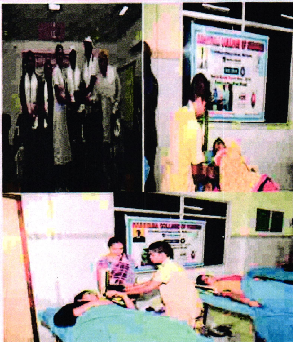
Fig: Faculty were checking Blood pressure to the blood donors

Recognized by Indian Nursing Council vide letter No. 18-91/524003 dated: 06.11.2002. Affiliated to NTR University of Health Sciences, A.P. Vijayawada E-mail: narayana_nursing@yahoo.co.in website: www.narayananursingcollege.com