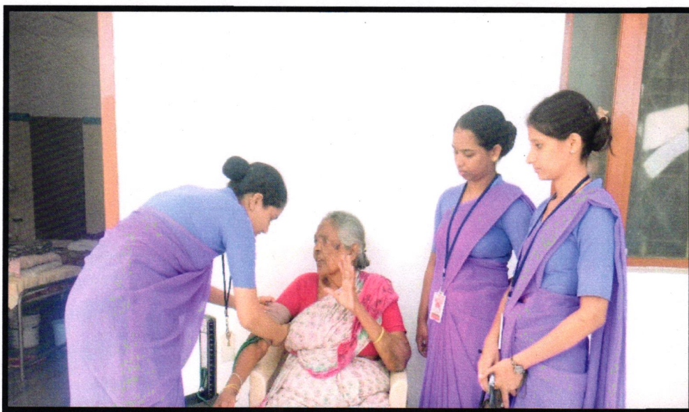
Checking BP of Community Member, Kakatur, 29/7/2019

The event was well-organized and successfully enhanced health awareness, reinforcing the importance of routine health check-ups for disease prevention and overall well-being.