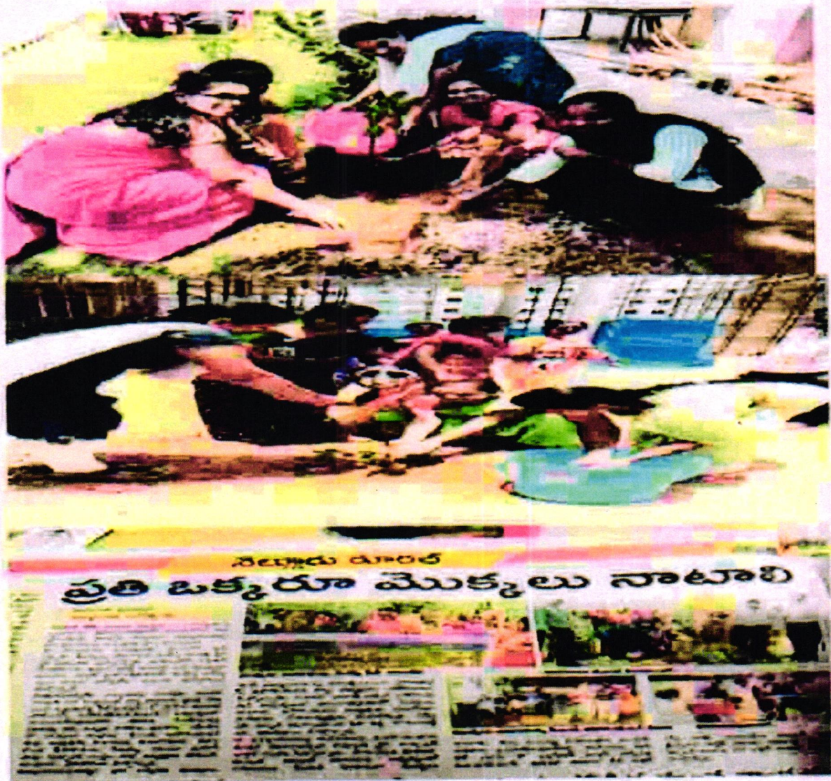
Fig: Plantation by faculty and students

e-mail : narayana_nursing@yahoo.co.in website : www.narayanannursingcollege.com